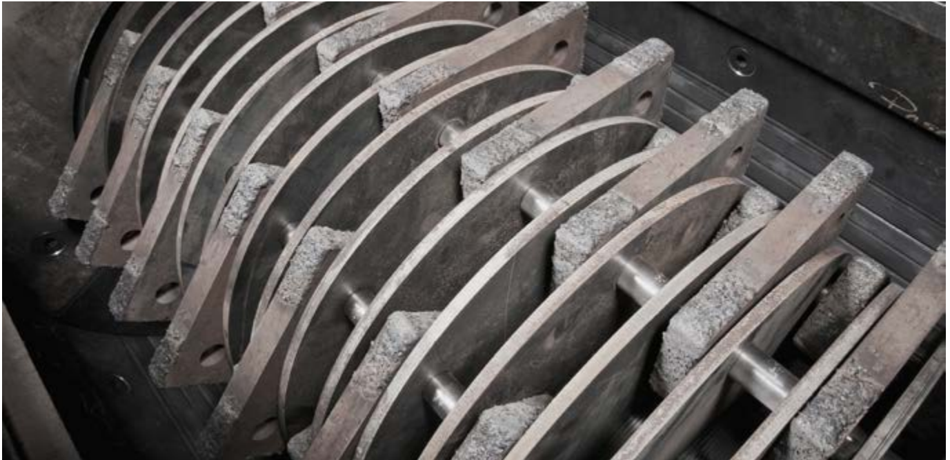
WA Series rotor assembly featuring optional tungsten carbide coated hammers for highly abrasive applications.

The WA Series is a gravity discharge hammer mill that can be constructed with a wide variety of grinding rotors and screen configurations to guarantee unmatched performance. Available in more than 20 sizes, ranging from 6" to 72", each mill features replaceable wear plates to protect the mill housing from wear that may result from processing abrasive materials. All models of the WA Series are custom configured to suit the user's material and production goals. In-feed and discharge chutes are designed to accommodate any method of feeding and takeaway, ensuring a clean and safe operating environment.